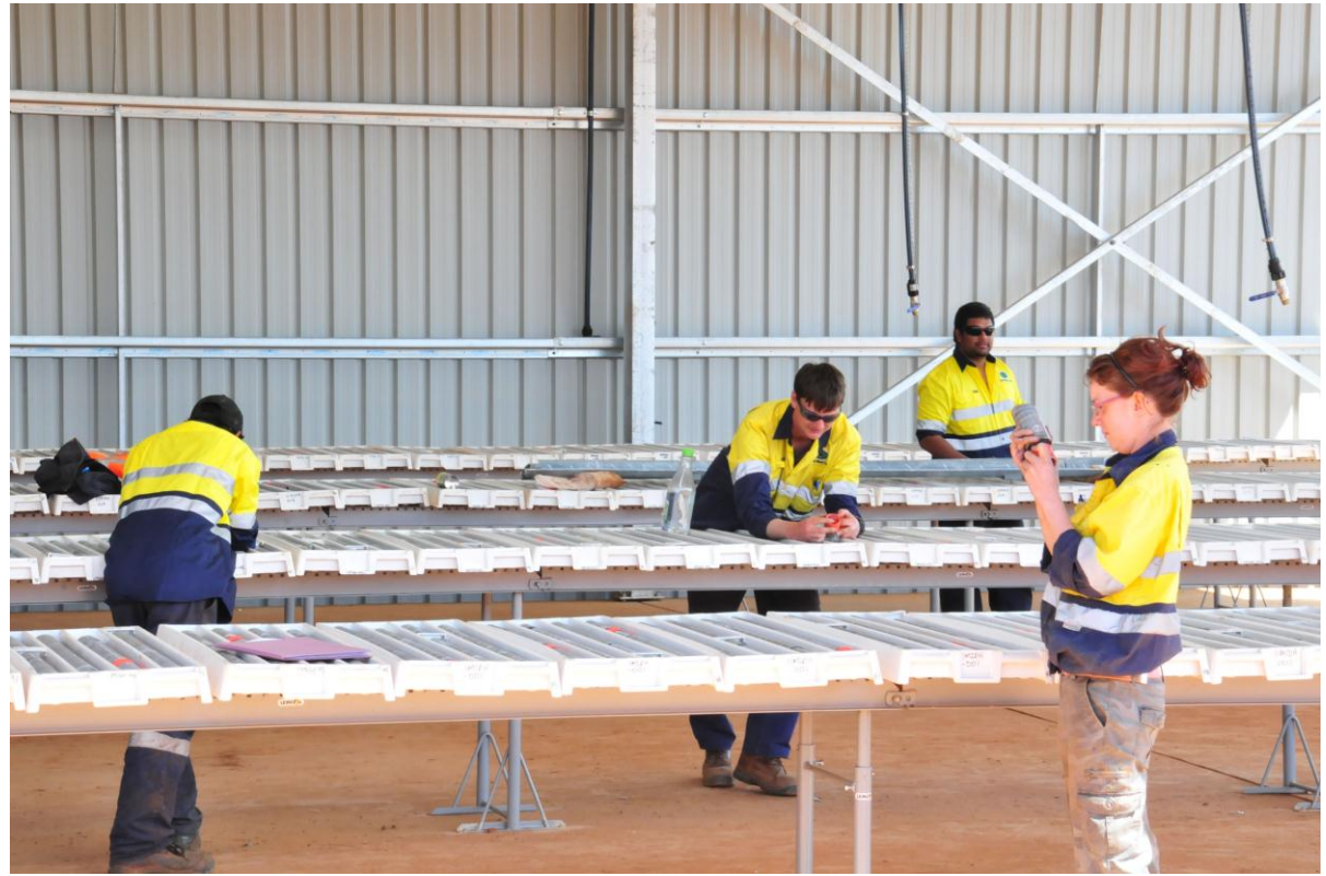
Mount Ida - Logging of core

Jupiter has established a core and sample handling facility at site. All drill cores are logged and cut at site before dispatch to the Laboratory for analysis.