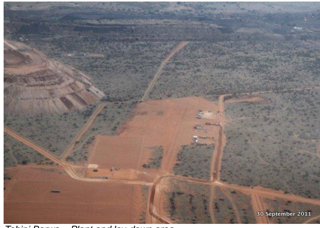
Tshipi Borwa – Plant and lay-down area

Regular site photo updates, as construction progresses, will be posted at www.tshipi.co.za.