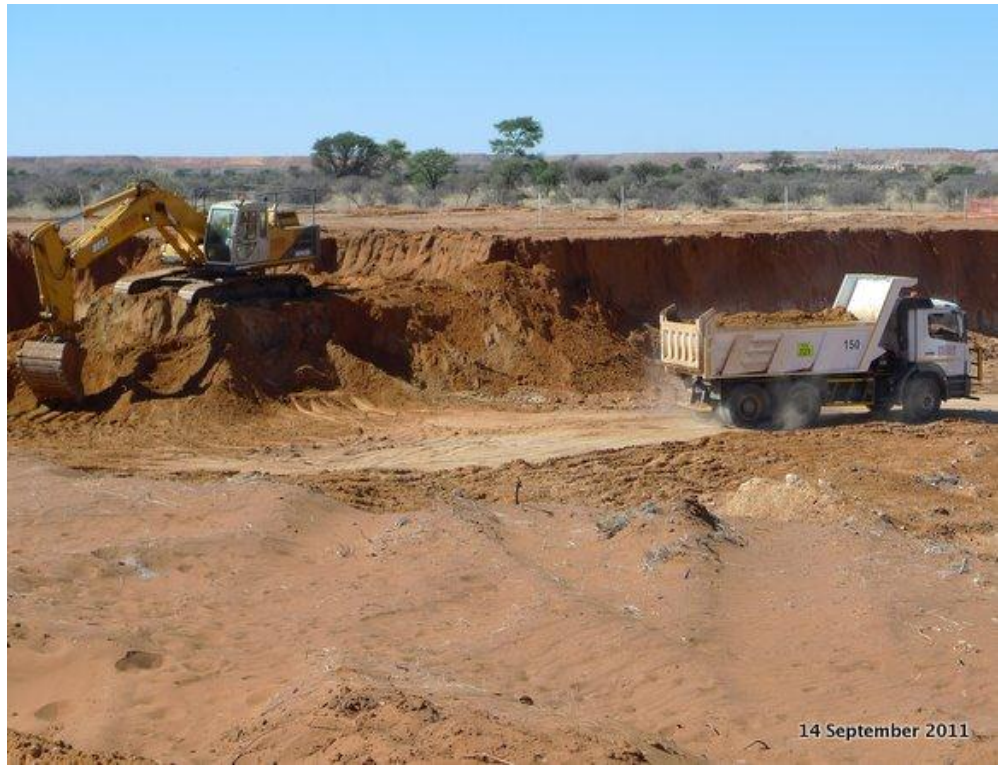
Tshipi Borwa - Storm water pit excavations