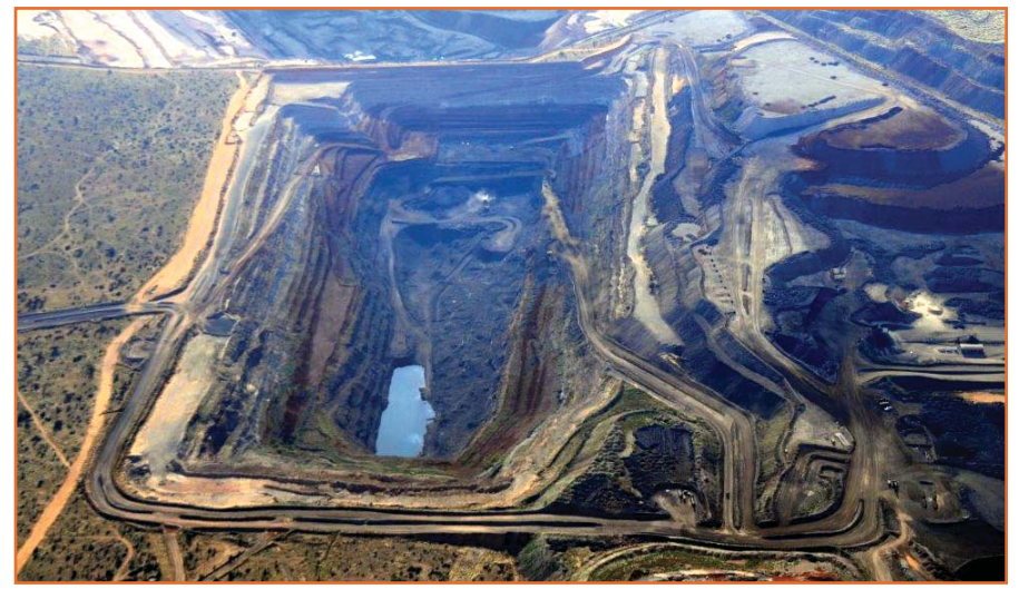
Figure 2 - Tshipi Borwa pit

During the year, the manganese price recovered considerably, and combined with tight cost controls, Tshipi comfortably exceeded its production and profitability targets, generating a cash balance of over ZAR1.5 billion at year end.