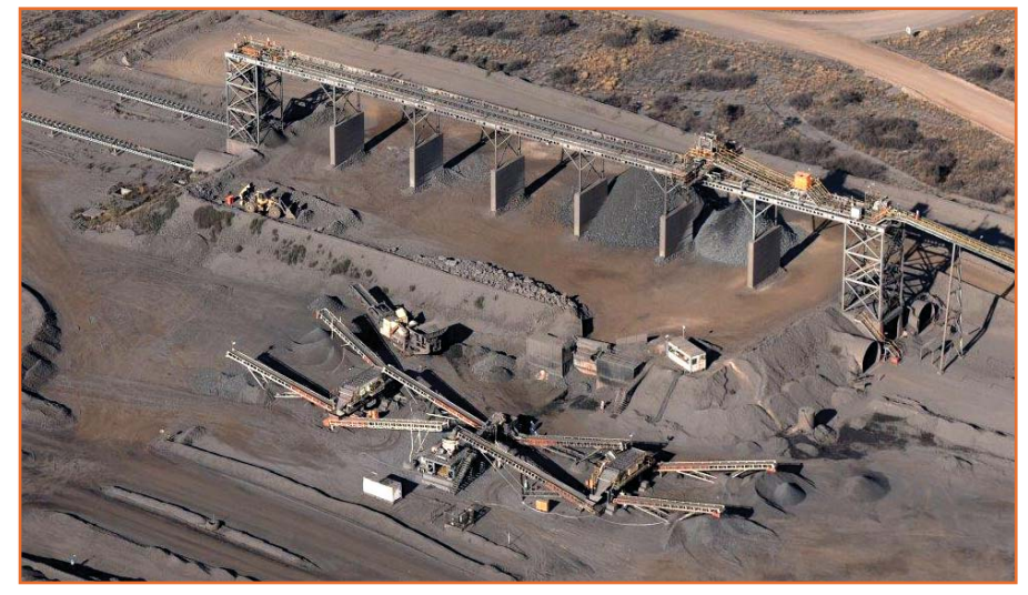
Figure 3 -Tshipi Borwa plant

With no external debt to be repaid, it was announced in November 2016 that Tshipi would distribute ZAR1 billion to its shareholders. This distribution represented approximately 50% of the capital investment originally made to develop the mine.