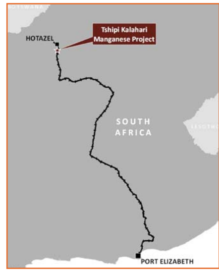
Figure 1. Tshipi Kalahari Manganese Project Location Map

The Tshipi Borwa mine has a life of mine in excess of 60 years. The plant and infrastructure has been developed for an annual production capacity of 3.6 million tonnes, with a rail siding that can accommodate up to 2 trains at a time, being loaded in 3 to 4 hours.