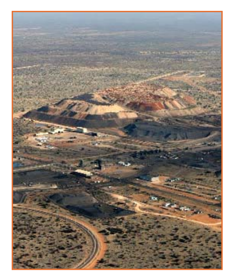
Figure 4 -Tshipi Borwa