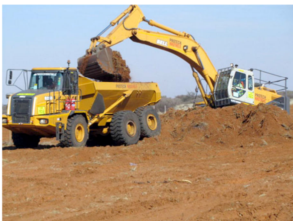
Site clearing, removal of topsoil

Tshipi has received the assay results which confirmed the continuity of mineralisation and has engaged independent geological consultants to conduct the mineral resource estimate during the next quarter.