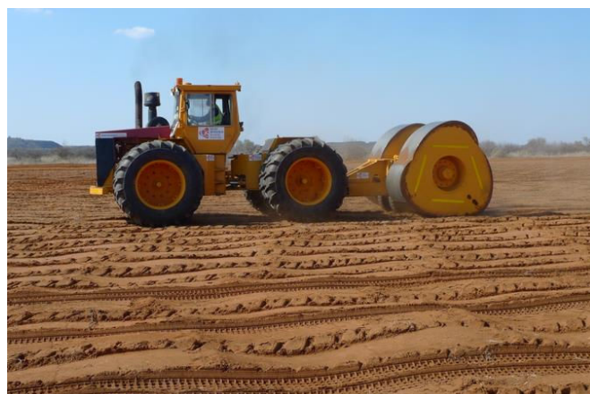
Impact compaction of the Kalahari Sands