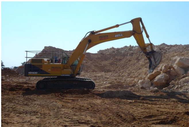
Construction rock loading