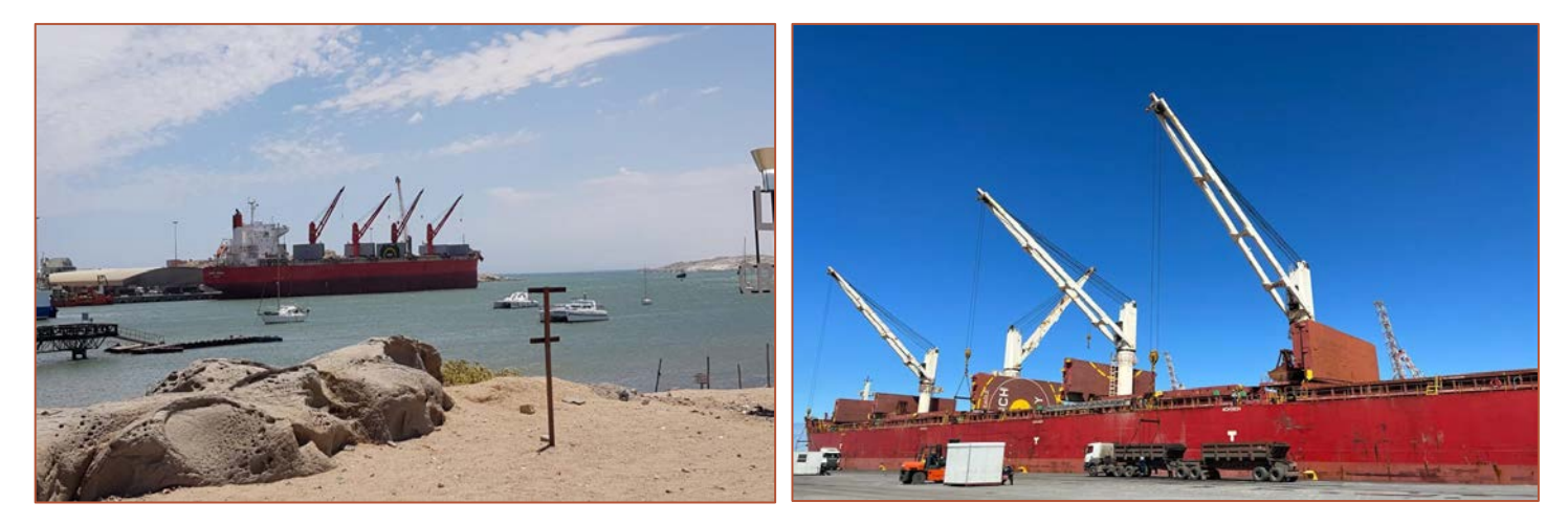
Figures 3 and 4: Port of Lüderitz and Port Elizabeth

An uptick in manganese ore prices, particularly for manganese ore with a 37% manganese ore content, has been noted after the end of the period. This is attributable to a decrease in supply particularly from higher cost logistics channels and ore producers which, as mentioned, has reduced stockpiles at main ports in China with total volumes last sitting at this level in July 2020. Seasonally higher crude steel production in China is expected in the last quarter of FY2024. These factors, coupled with an increase in forecast global crude steel production in 2024, should assist in supporting manganese ore prices in the short term, and particularly once destocking of manganese alloy stocks ensues.