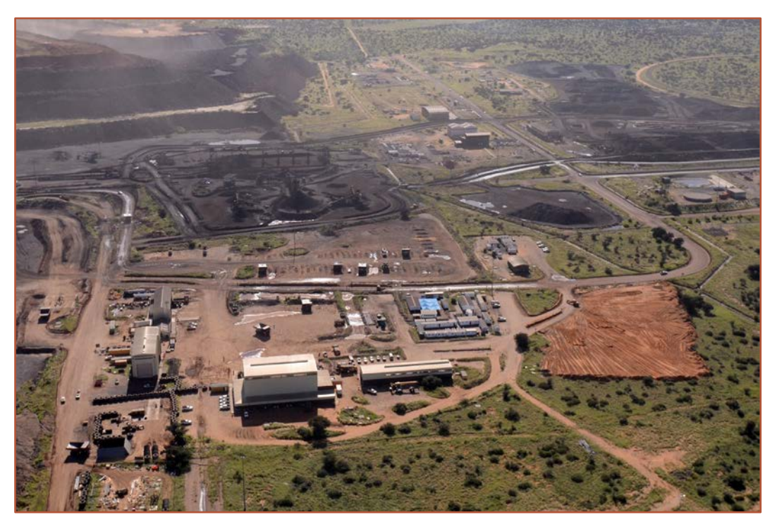
Figure 2: Tshipi Manganese Mine

Mining volumes improved compared to the prior comparative period. Tshipi commenced drilling interventions with labour availability improving also. Production volumes increased significantly during the period, with Tshipi achieving production records. Low grade production recommenced to meet requested mine gate sales as well as to take advantage of increased rail availability. Healthy stockpiles remained at the end of December 2023.